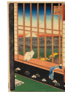
UTAGAWA Hiroshige, "One Hundred Famous Views of Edo: Asakusa Rice Fields and Torinomachi Festival", 1857