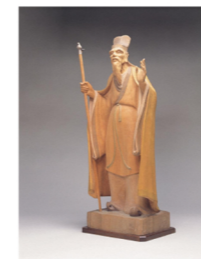
YAMASAKI Choun, "Stick Topped with a Pigeon", 1932, collection of the museum