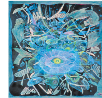
ATOYAMA Yoko, "Premonition of Blossoms A" (Winner of the 80th Fukuoka Governor's Prize, Western Painting Division)

Phase 1: Sculpture and Photography Sep 1 (Tue) - Sep 6 (Sun) Phase 2: Japanese Painting, Crafts, and Design Sep 8 (Tue) - Sep 13 (Sun) Phase 3: Western Painting Sep 15 (Tue) - Sep 20 (Sun) Phase 4: Calligraphy Sep 22 (Tue) - Sep 27 (Sun)