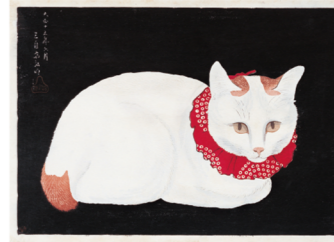
TAKAHASHI Shotai, "White Cat", 1926