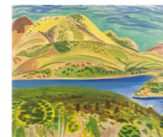
KOJIMA Zenzaburo, "Hakone", c.1938, collection of the museum

A diverse selection of works from the Fukuoka Prefectural Museum of Art collection is presented.