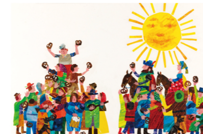
Illustration for Walter the Baker , 1995

All art by Eric Carle. Collection of the Eric and Barbara Carle Foundation. ©Penguin Random House LLC.