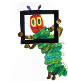
"Promotional poster for founding of the Eric Carle Museum", 2002