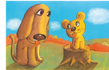
"The Kind Lion", 1975

©YANASE Takashi Collection of Yanase Takashi Memorial Anpanman Museum Promotion Foundation