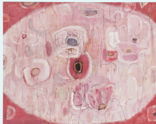
AKABOSHI Nobuko, "Red Composition", c.1974 Museum Collection

April 2026 to March 2027 Exhibition Schedule