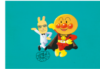
"Yanase Rabbit and Anpanman", year unknown